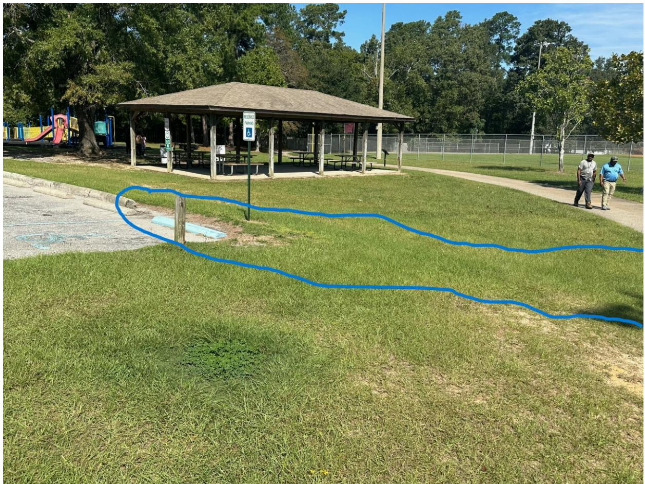
Curb at Caughman to be left as-is to allow drainage